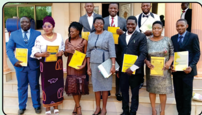
MBA Students after defense of their thesis with the Director of PGS

The programmes comprise of course work and thesis. Students shall be given all study materials in advance including lecture notes to work on their own and only come for campus lectures once in a while as shall be communicated from time to time. CIM or LUC shall organize examinations twice a year in June and January to assess the candidates. The duration of the programme is one or two calendar years depending on the specialty. Degrees awarded meet European standards and are internationally recognized. For University of Buea mentored programmes, the duration is two academic years and shall follow a calendar of activities to be drawn by the Postgraduate School.